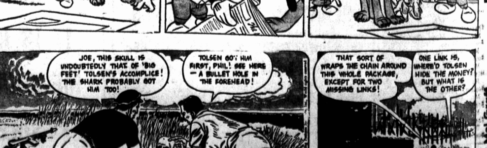
Secret Agent X9