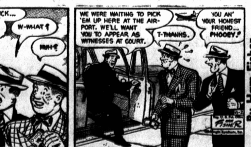
Secret Agent X9