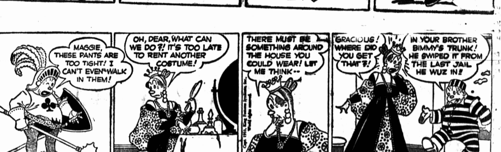
Braining Up Father