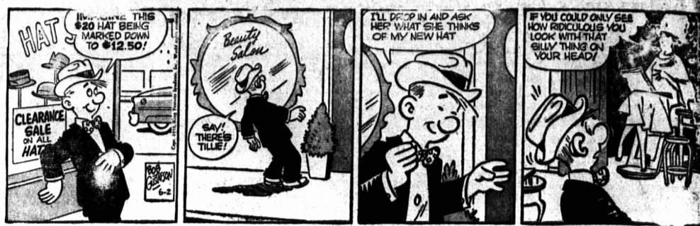
Tilly the Toilet