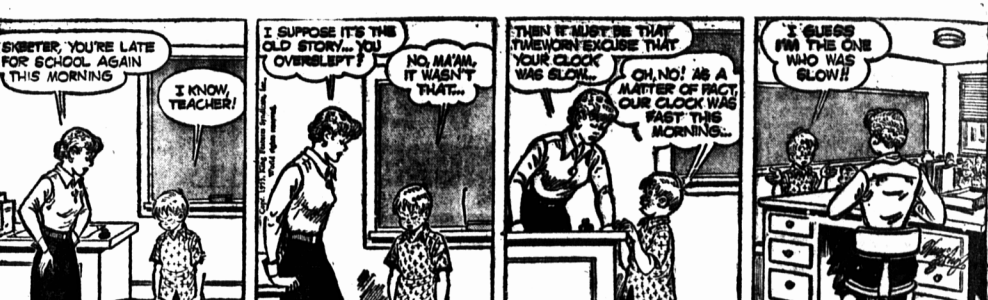
Muggs and Skeeter