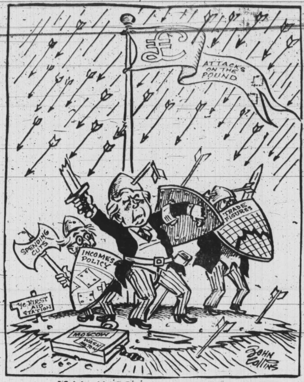
1066 - HAROLD AT HASTINGS - 1966

Already, it is noted, most Western European countries have erected symbol signs, with satisfactory results. Certainly it is a system which has everything to commend it from the standpoint both of safety and convenience.