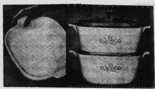
From Freezer To Range CORNING WARE

Unharmful by hottest heat or coldest cold... use it for baking and then as a serving dish, because besides being useful it's also pretty to look at - all in one