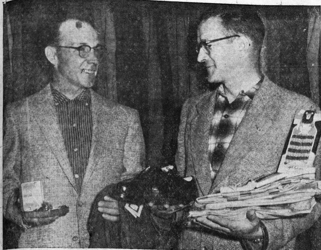
FATHER'S DAY WINNER