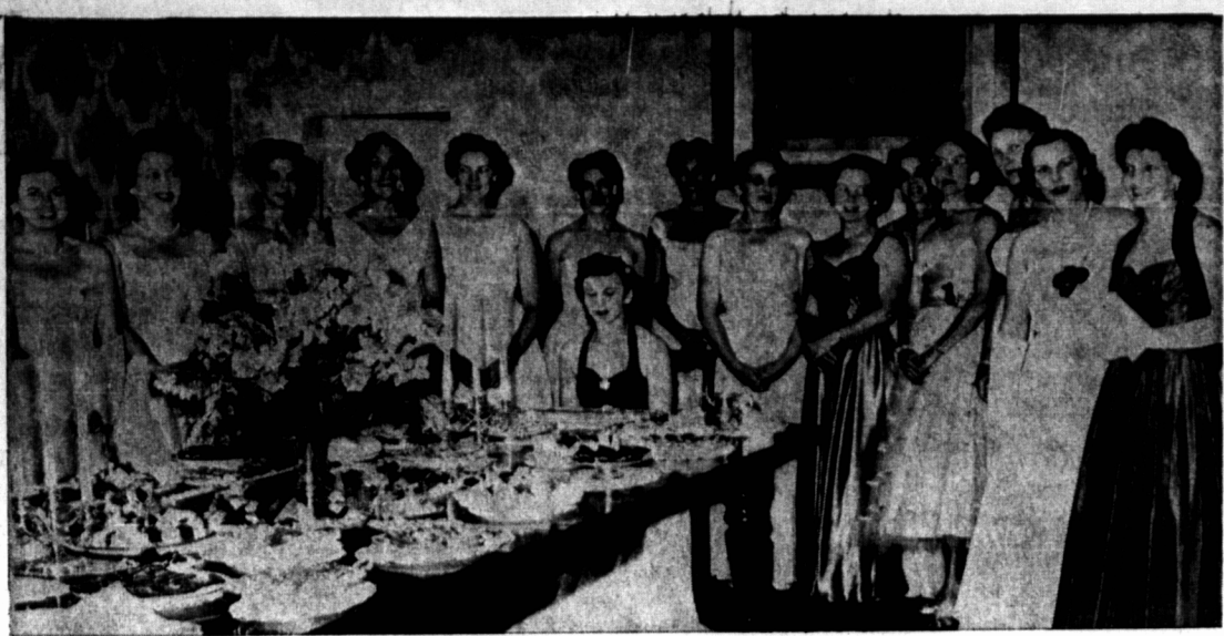
His Honour the Lieutenant Governor at a formal dinner Friday evening at Government House, Victoria Park. Pictured above are during the supper hour, some of the guests who assisted.