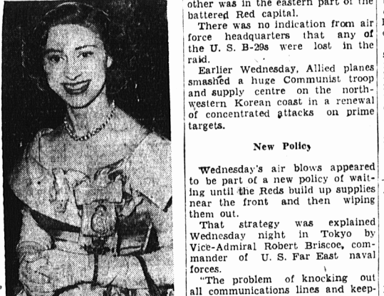
LONDON, Aug. 20 (CP)—A touch of sadness will almost certainly shadow the thoughts of Princess Margaret when she celebrates her 22nd birthday tomorrow within the granite walls of Balmoral Castle.