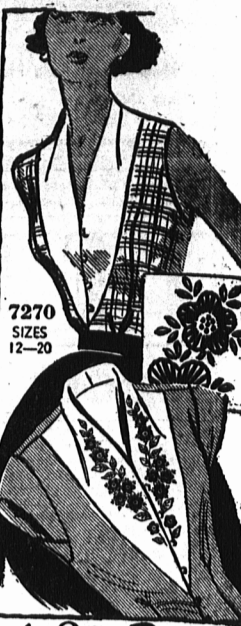
7270 SIZES 12-20

Send Twenty-five Cents in coins for this pattern (Stamps cannot be accepted) to ALICE BROOKS Designs, c/o The Guardian, 60 Front Street West, Toronto, Ontario. Please print plainly Name, Address, and Pattern Number.