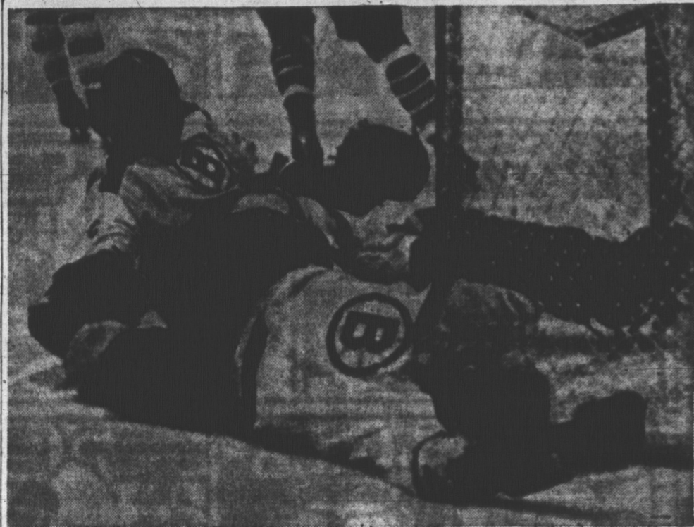
DOAK, PARENT, POST COLLIDE

The Saints, playing with only ten men dressed, opened the scoring at 12:07 of the first period as Whitlock converted pass-