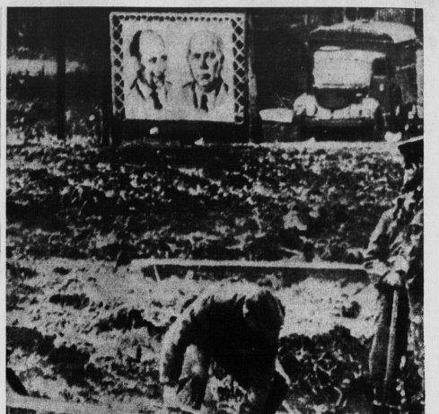
KHRUSHCHEV STILL UP ON RED WALL

cover underground blasts. The West has insisted effective inspection and control procedures be negotiated before it will agree to a ban on underground test explosions. The Pravda call appeared on the surface to be a gesture towards the Chinese though there have been reports Russia may be getting ready for serious negotiations with the West on controlled abolition of all nuclear tests. APPEARS IN CONTROL Meanwhile the new leadership appeared to be in full control, having gathered in the power systematically and with the little outward sign of struggle. Moscow was in a festive mood Sunday as preparations continued for the triumphant entry into the capital of Russia's three new comrades. Flags, banners and overhead lights bedecked streets in many parts of the city. There is speculation Brezhnev or some other high official will use the occasion to deliver a statement on the policies of the new administration and perhaps fill in some of the back ground of Khrushchev's sudden ouster.