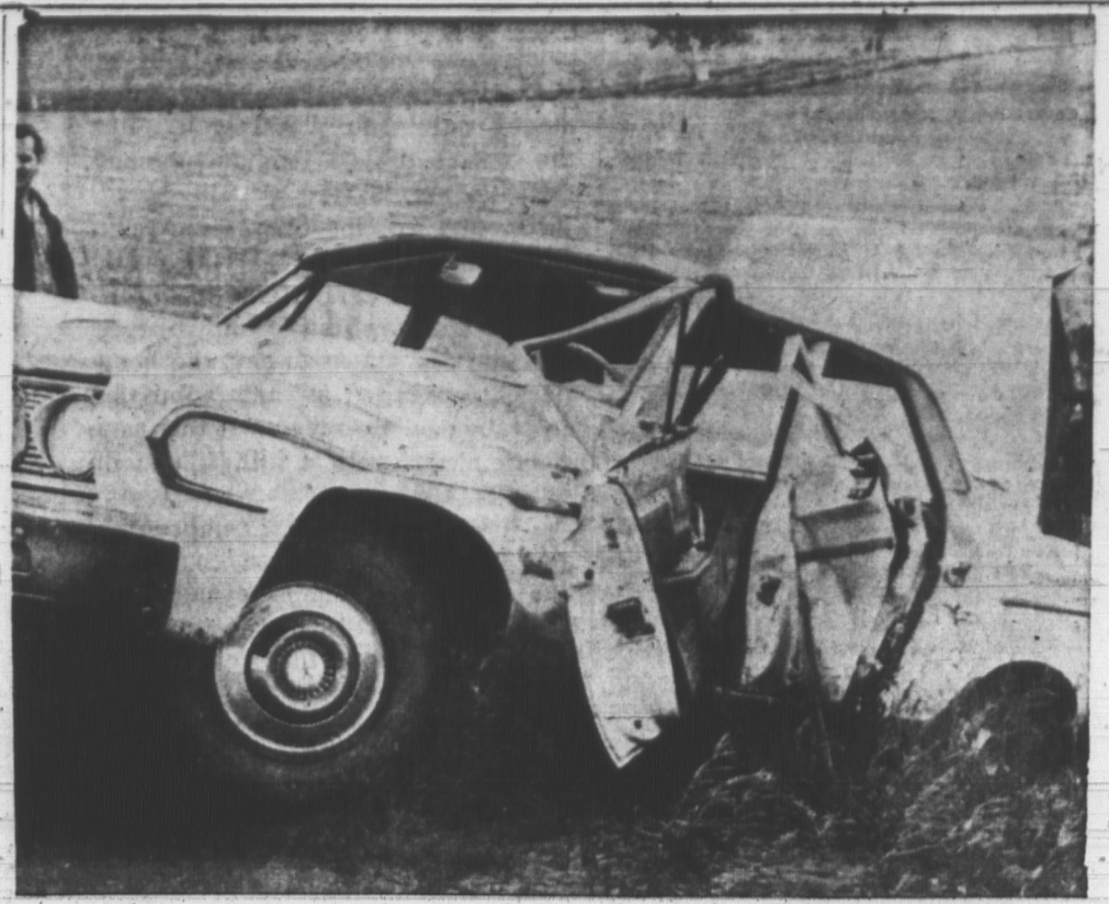
OCCUPANTS ESCAPE AFTER CAR ROLLS SEVERAL TIMES

SUMMERSIDE — The owner and driver of a 1964 model car along with six other occupants miraculously escaped serious injury Saturday afternoon at approximately 5.30 when the vehicle went out of control a couple of hundred feet from Woodleigh Replicas at Burlington and rolled a number of times before coming to rest on its wheels along a sloping ditch.