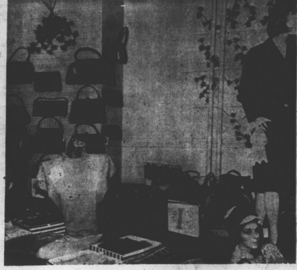
Pictured above is just a sample of the wonderful gifts on display at the GLORIA LADIES' WEAR , Queen Street.