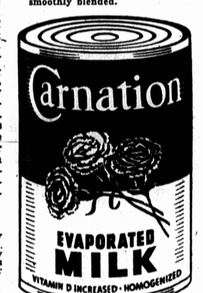
"from Contented Cows"

FREE: Carnation's "Velvet Blend Book" of tested recipes, new and old. Write to Carnation Company Limited, Toronto or Vancouver.