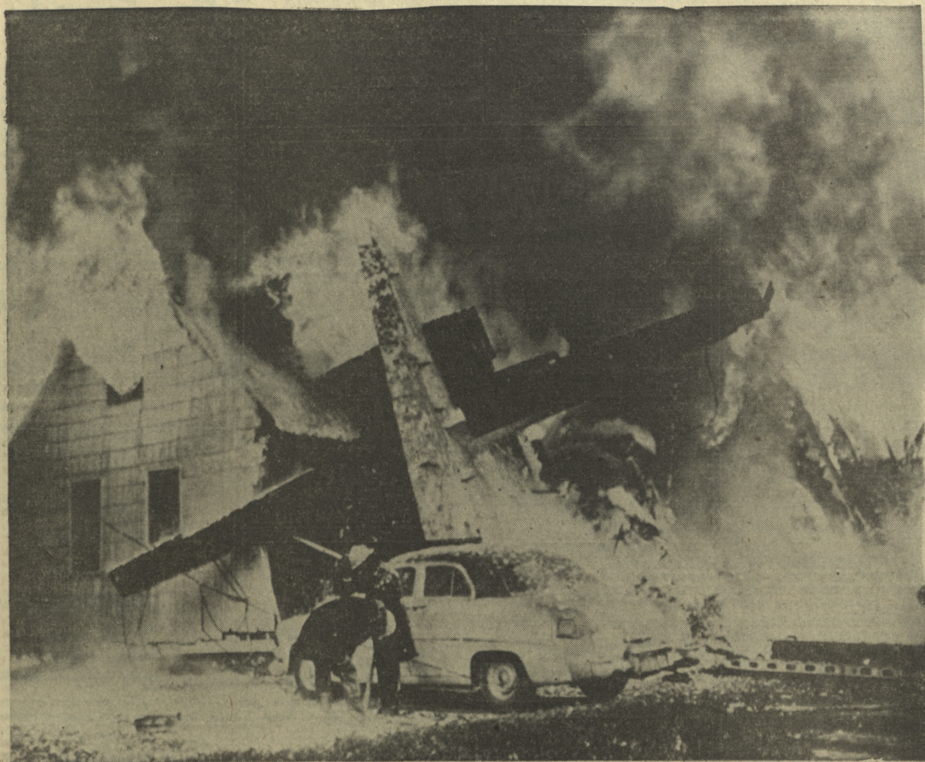
FIERY DEATH FOR SIX

This U.S. Navy tanker at Norfolk, Virginia, smashed into two houses, killing its four of the houses.