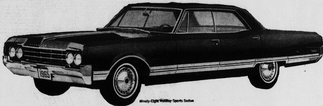
Ninety-Eight Waltham Sports Sedan

We know you may not dash out and buy a '65 Oldsmobile after reading this ad. But how about dashing out and looking at one? They're at your dealer's, now.