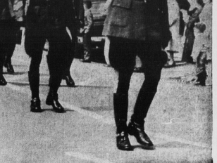
"L" DIVISION RCMP HOLDS PARADE