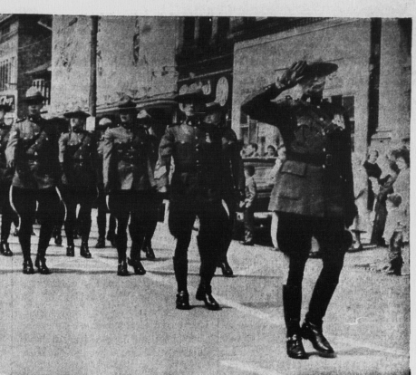
"L" DIVISION RCMP HOLDS PARADE

WHERE THREE DIED Onlookers contemplate a once-sleek convertible that crashed into a telephone booth near Shannon, Que., leaving three teen-age passengers dead and two others seriously hurt. Shannon is 20 miles north of Quebec City.