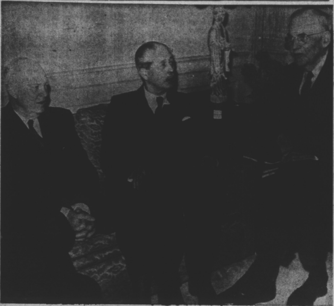
HIGH LEVEL TRIO

VOL. LXXII NO. 69 CHARLOTTETOWN, CANADA, MONDAY, MARCH 23, 1959 14 PAGES NOT MORE THAN FIVE CENTS