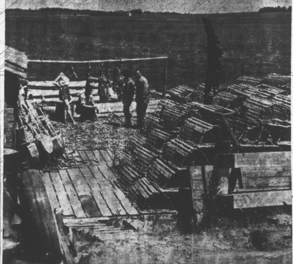
One of the many quaint fishing villages which dot the P.E.I. coastline.