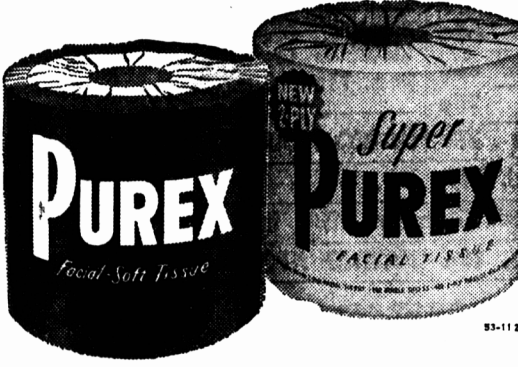
TWO NEW IMPROVED PUREX TISSUES

"Oh so beautifully soft" are the new Purex tissues... so firm and strong... so gentle and kind to the skin they're perfect for baby, and grown-ups too.