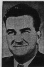
Hon. Gordon Churchill Minister of Veterans Affairs