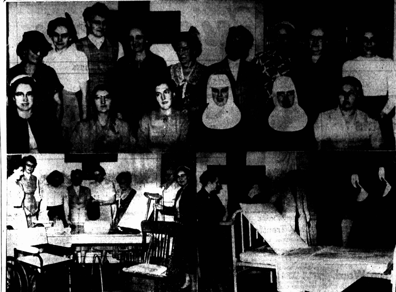
Complete Red Cross Home Nursing Course

OTTAWA (CP) - Average weekly pay in Canadian industry reached a record $62.07 a week at Nov. 1, the bureau of statistics reported Tuesday. The previous high, at Oct. 1, was 58 cents less. At Nov. 1, 1954, average pay was $59.78.