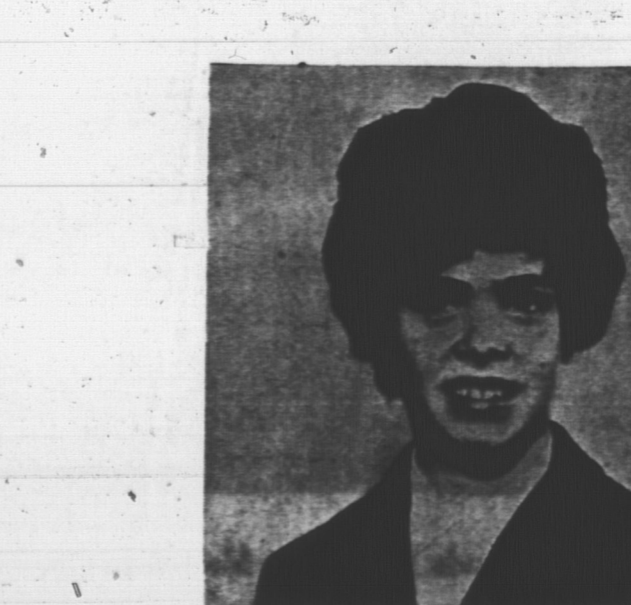
MISS TIMMY OF 1965