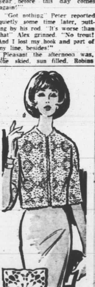
by Alice Brooks LACE SETS PACE!

Go BASIC by day in the high-neckline version - go FEMINE for dinner in the scooped style with graceful scarf tie. Styled to slim. Printed Pattern 4865. Half Sizes 12½, 14½, 16½, 18½, 20½, 22½, 24½. Size 16½ takes 3¼ yards 38-inch fabric.