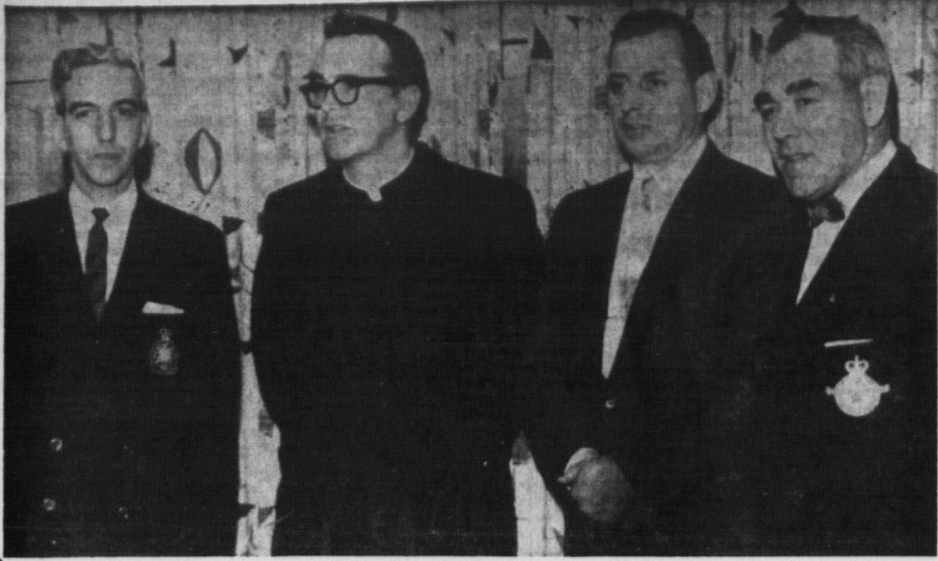
AT MAIN BRACE DINNER