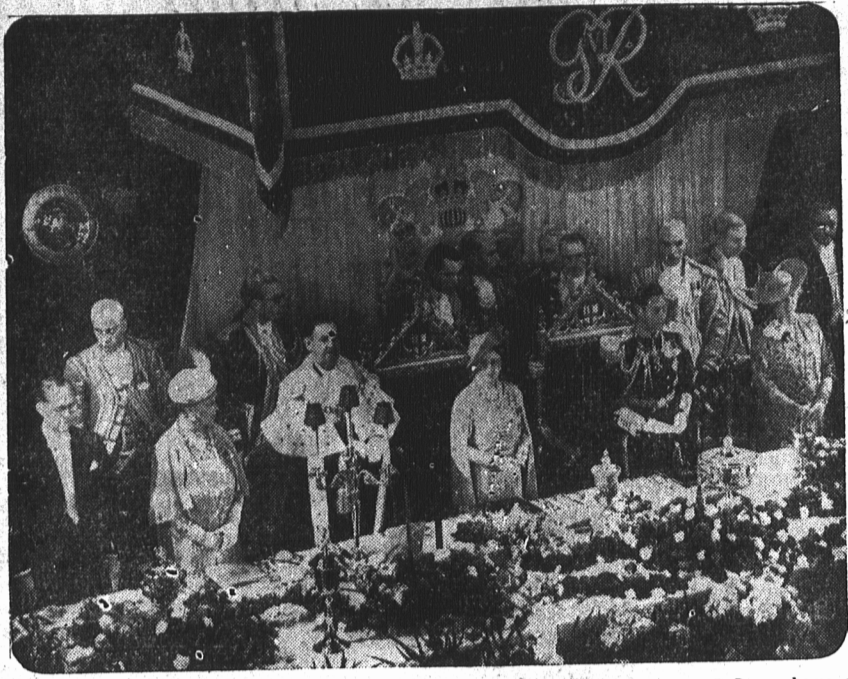
On the day after their return the City of London officially welcomed the King and Queen home at a brilliant formal luncheon at the Guildhall. In this group of notables, photographed while Grace was being said, at (left to right) Joseph Kennedy, United States Ambassador to Great Britain; Queen Mary; Sir Frank Bowater, Lord Mayor of London; the Queen, the King, and Lady Bowater.