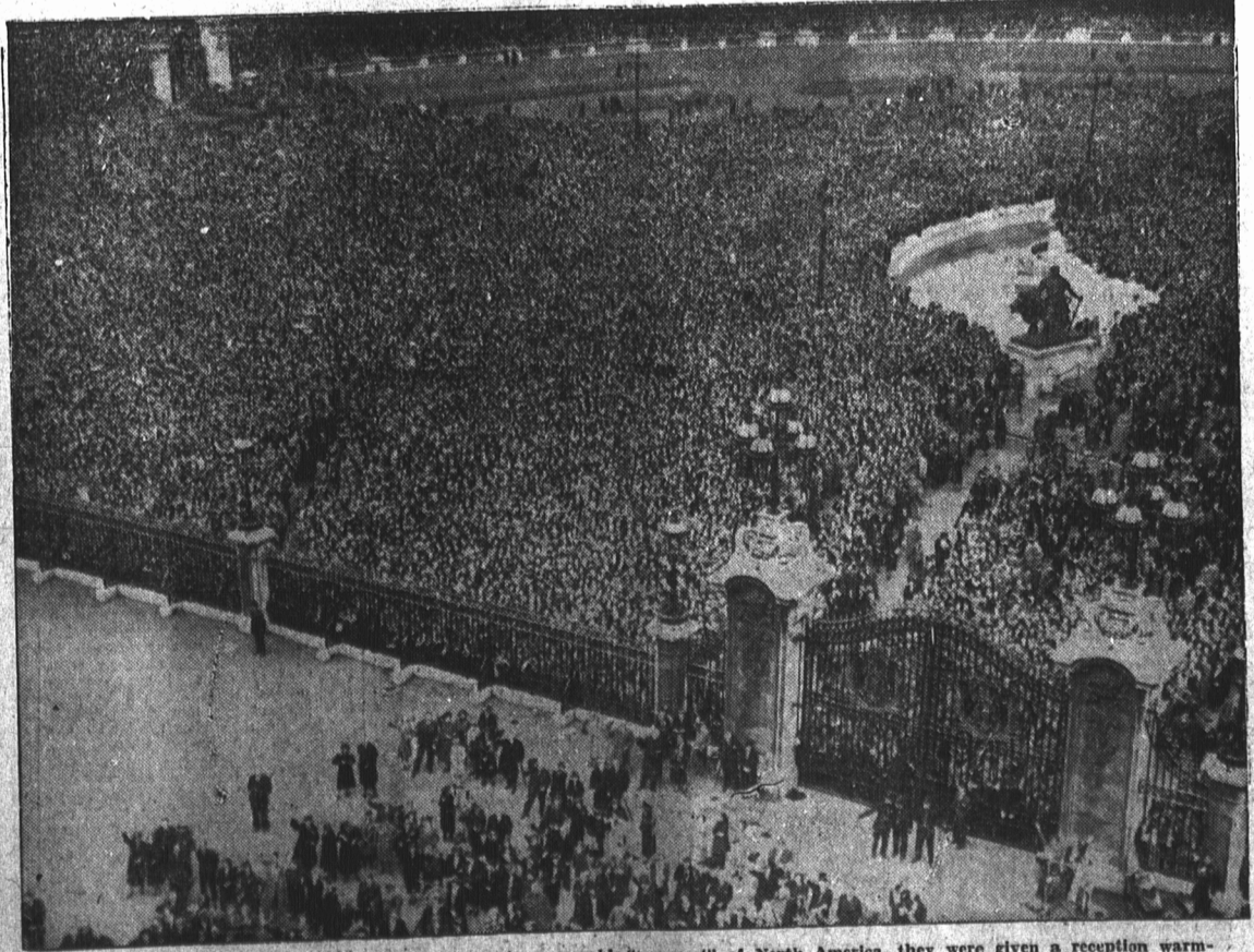
When Their Majesties returned to London after their memorable "conquest" of North America, they were given a reception warm-hearted and enthusiastic beyond anything that great city had ever seen before. After their arrival at Buckingham Palace, a tremendous crowd gathered outside the gates to cheer and shout "We want the King and Queen." This striking picture of the vast sea of faces taken from the Palace roof, shows the dense throng that remained for several hours, hoping that Their Majesties would, as they did come out to the balcony to acknowledge the cheers.