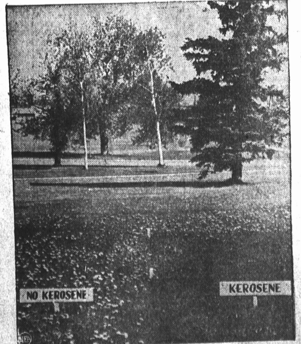
Have you a bumper crop of those pesky yellow flowers on your lawn? Try the water-white kerosene treatment, perfected by A. H. Post of the agricultural experiment station at Bozeman, Mont. Kerosene is sprayed on grass the previous fall; picture shows what happens. Caution: only water-white kerosene, please. Colored kerosene will kill dandelions, okay—and the grass with them.