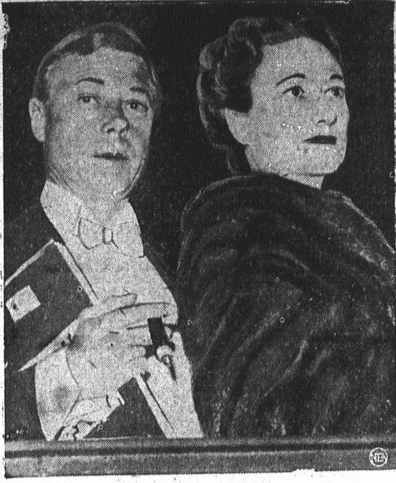
Now reported contemplating a sojourn at Aix-les-Bains, continental watering place, to cure a rheumatic condition, the Duchess of Windsor is shown in this, her latest, photograph. It was taken in the Eiffel Tower, Paris, where she and the Duke dined to celebrate his 45th birthday. The day also marked the Tower's 50th anniversary.