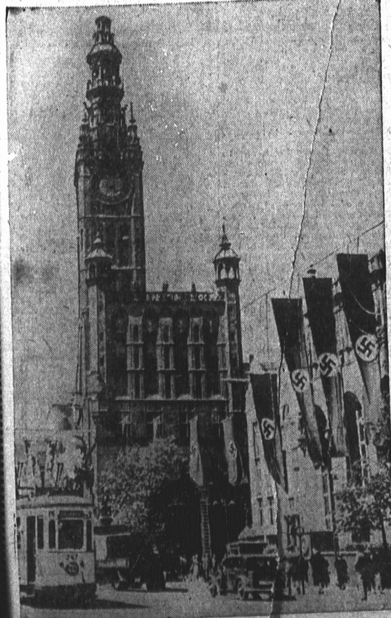
Portent of the manner in which Adolf Hitler may choose to "solve" the Danzig "problem" is this display of swastika flags near the Free City's ancient City Hall. European chancelleries believe the thousands of Nazis pouring into Danzig may try Hitler's now familiar internal coup and declare their "home" is in the Reich.