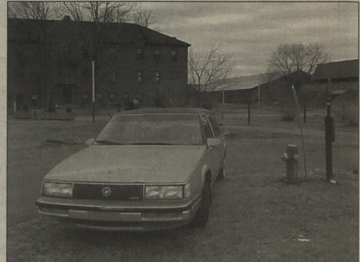
In haste, the parker clearly blocked a fire hydrant. What if the grass were to catch on fire, asshole?