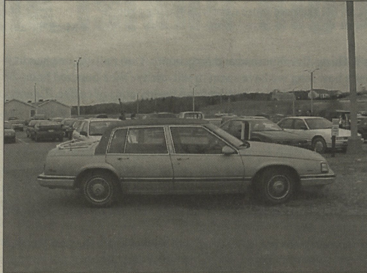
This person couldn't find a parking spot, so he or she hastily parked while he or she ran some stupid errand.