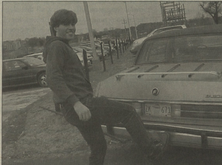
A hearty boot to the bumper gave me satisfaction, but also left my foot quite sore and broken.