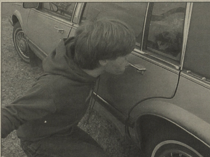
People don't believe that I lick the door handles of every bad parker's car I photograph. Believe now?