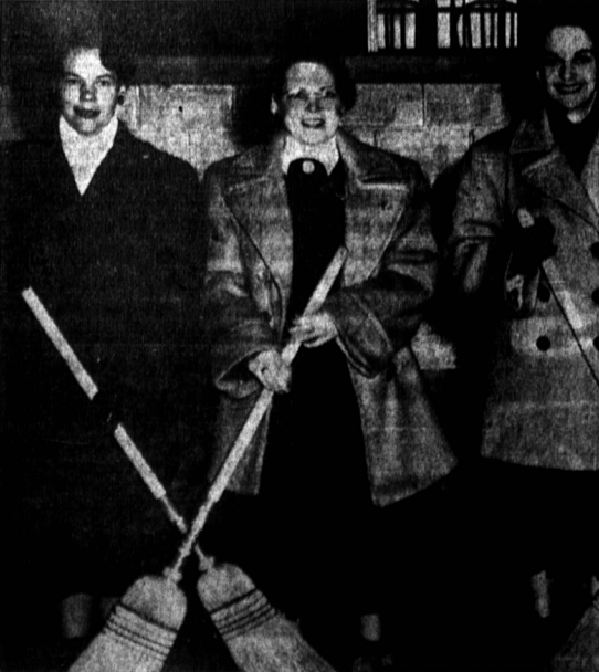
Will Represent Summerside Curling Club