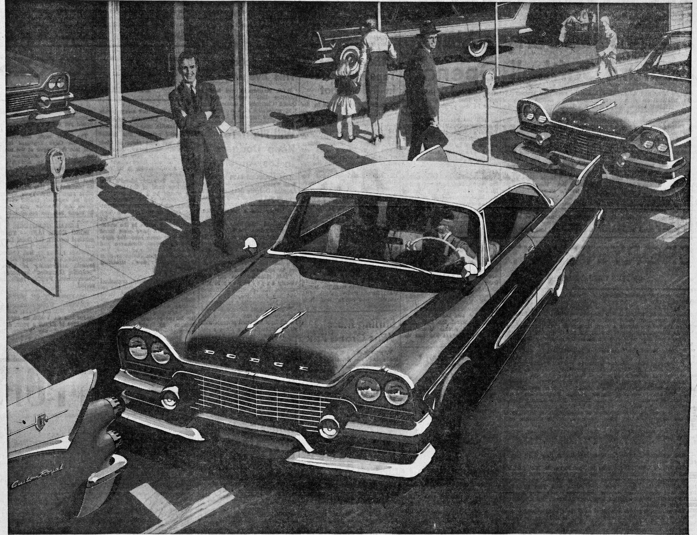
In crowded city traffic or out on the open road, this good-looking Dodge Regent 2-Door Hardtop takes top honors for smooth going!