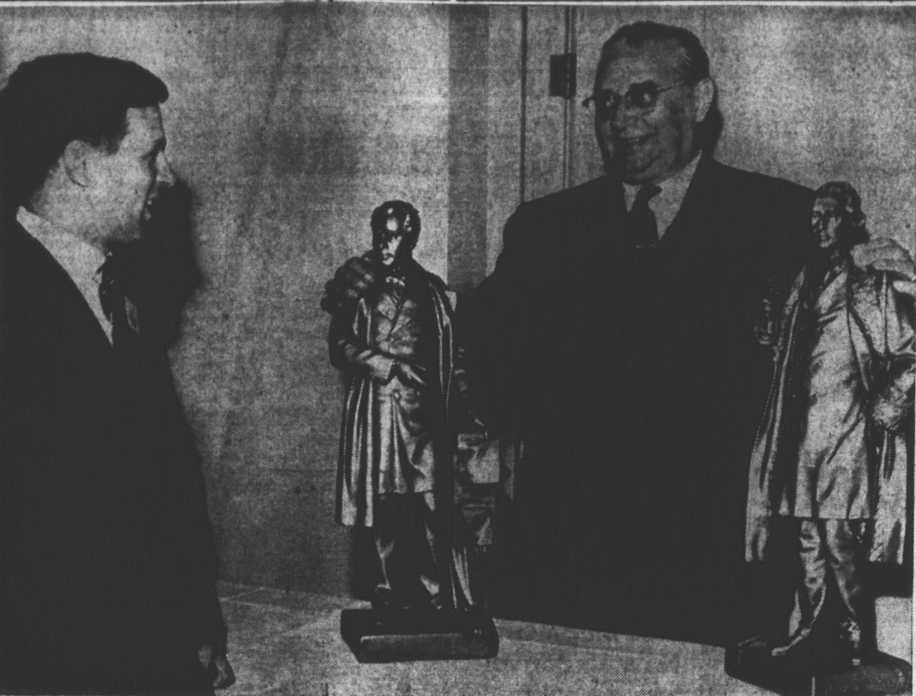
STATUETTES PRESENTED TO PREMIER SHAW