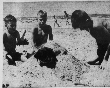
Tourists, especially those with young steps, find on P.E.I. some of the finest beaches in Canada . . . and indeed, in North America. Many families return to these shores year after year, and visitors enjoy their swim in the warmest waters north of Florida.