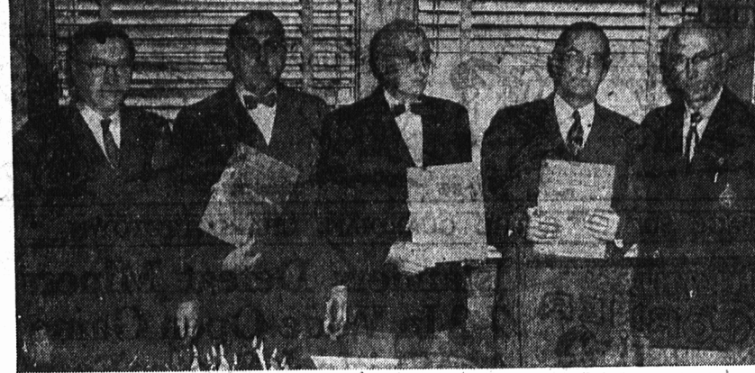
Presentation of illuminated addresses and veteran buttons to charter members of Alpha Y's Men's Club at the 27th annual meeting Thursday night.

This column is reserved for news of local interest, but advertising of a new nature may be inserted at five cents a word, strictly payable in advance.