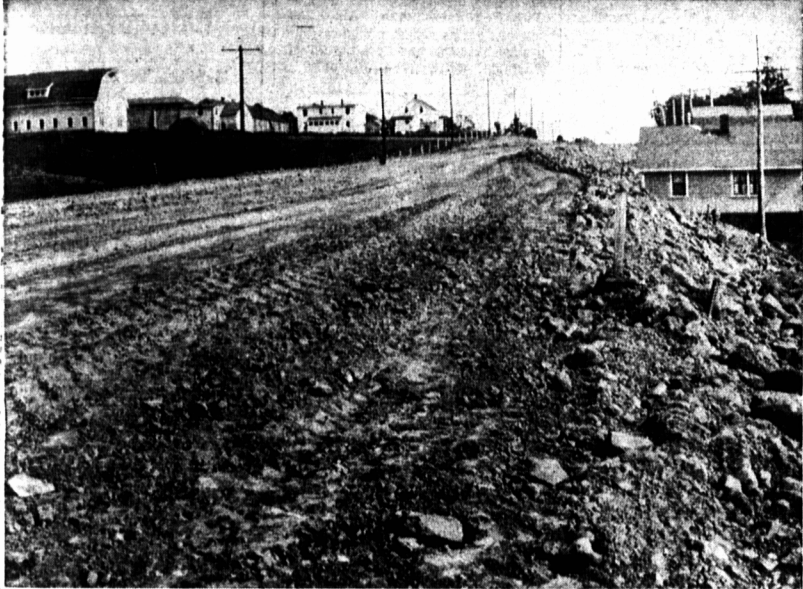
SECTION OF TCH FILL NORTH OF ST. DUNSTAN'S COLLEGE