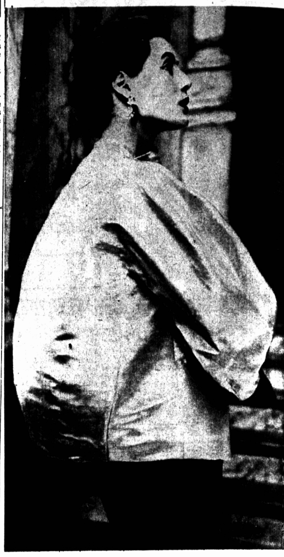
This pink-lame jacket illustrates the new scarab line introduced to London's fall fashion by designer John Cavanagh. The scarab line, with flat front and bloused back effect, follows the outline of the scarab beetle. A sacred symbol of ancient Egypt. The jacket curves in a half-moon from the rounded shoulders to just below the waist. It is fur-lined with sapphire bassetisk and is worn over a straight short linner dress.

Morning Smile "What flavors of ice cream do you have?" asked the customer. The pretty waitress answered in a hoarse whisper, "Vanilla, strawberry and chocolate." "Trying to be sympathetic he said. 'You got laryngitis?'" "No," she replied with an effort.