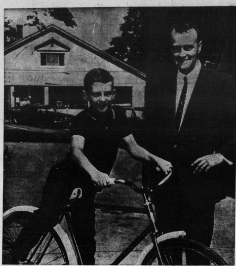
CARRIER BOY WINS BIKE

Two local firms were each fined $10 and costs or five days for operating a vehicle with inefficient equipment.