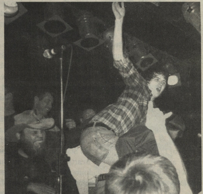
I see you baby, shakin' that ass.

Despite only band being declared the winner of this competition, it was clearly a victory for the entire House of Rock. Slowcoaster got a giant cheque to buy a new bass with, and Rock Ranger transformed the Marquee into a rock concert worthy of the Halifax Metro Centre, or at least Centre 200.