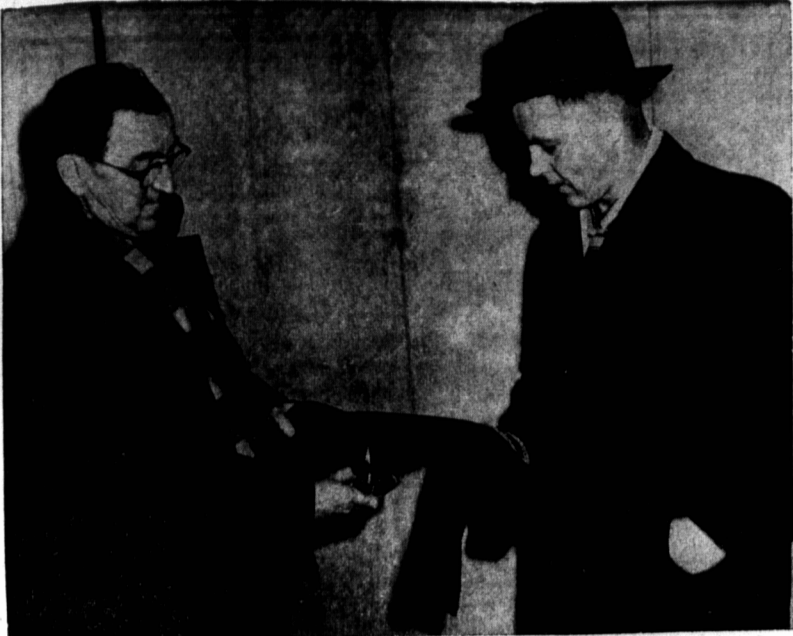
FIRE-TEST AUDITORIUM CURTAINS