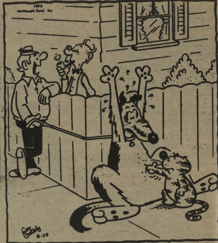
"HEATHCLIFF BETTER BEWARE OF OL' SARGE! ... SARGE IS A POLICE DOG!"