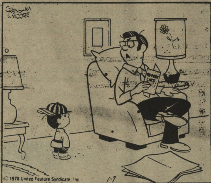
"What do you mean, 'Considering the hereditary factor, it isn't bad'?"