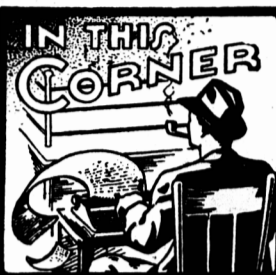
IN THIS CORNER

Charlottetown's first Festive Week came to a close over the week-end but its finale was a highly successful one in every sense of the word. Blessed with perfect weather during the two final days of activity, it was a welcome change from the anxious moments and disappointments caused by rain earlier in the week, and officials, participants and spectators made the most of it.