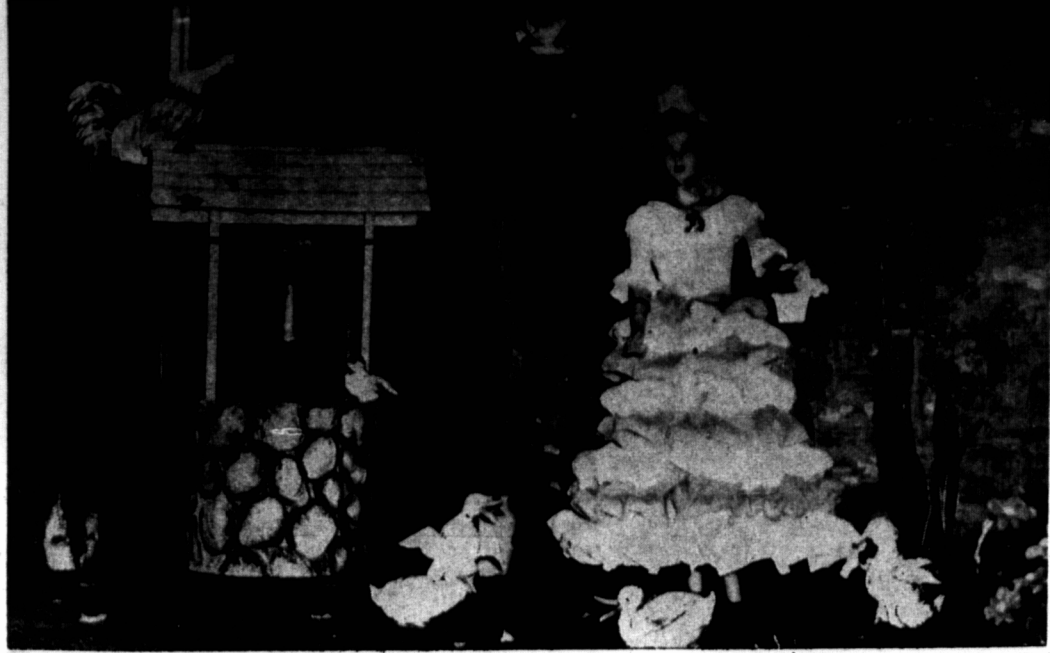
THE LITTLE MAID in her trills and bonnet pertly feeds her ducks in the stage setting.