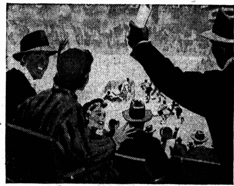
HOCKEY NIGHT AT "THE GARDENS"