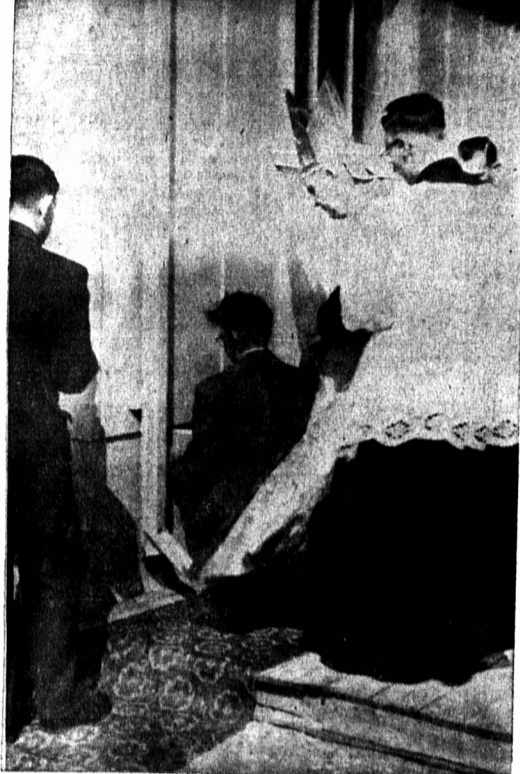
In the above picture Bishop J.A. MacEachern can be seen laying the corner stone of the new church of St. Anne's which took place yesterday at 9:30 a.m. In the top picture the large number of people can be seen witnessing the ceremony. The new church is the fifth to be erected in the parish. Three of the churches were destroyed by fire.