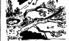
He couldn't resist the temptation. He went.