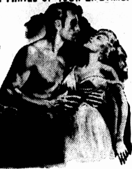
FILED BY M-G-M IN AFRICA IN TECHNICOLOR!

The forbidden love of a flame-haired Goddess and a dauntless White Hunter in a jungle Eden throbbing to the sinister beat of native tom-toms!