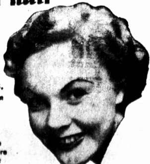
Get Headspin today — it's the amazing new hair waving discovery!

Simply comb this amazing cream through your hair for beautiful permanent waves. Yes... that's all you do, then wind in curlers and rinse. HERE'S NOTHING SO FAST... SO EASY One tube of Headspin will perm a full head or you can use just a little for waves here and there and keep the rest for another time. NO THING NO NEUTRALISING