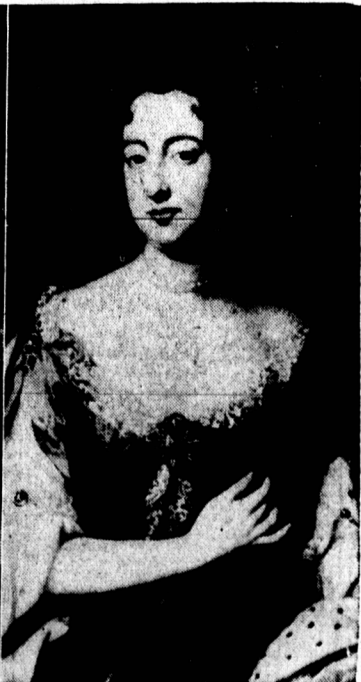
MARY II 1689-1694