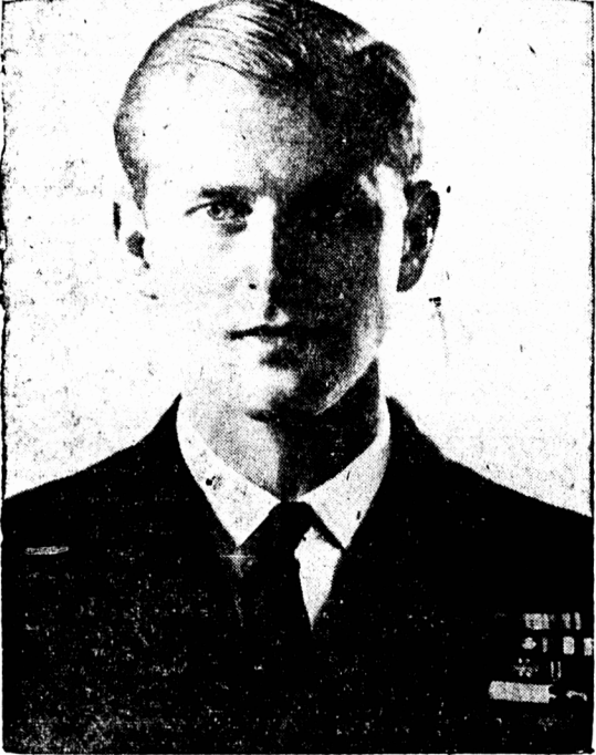
The Duke of Edinburgh, now Prince Consort?