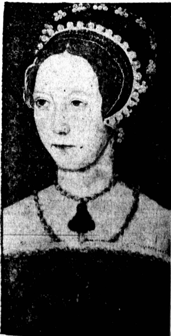
MARY I 1553-1558