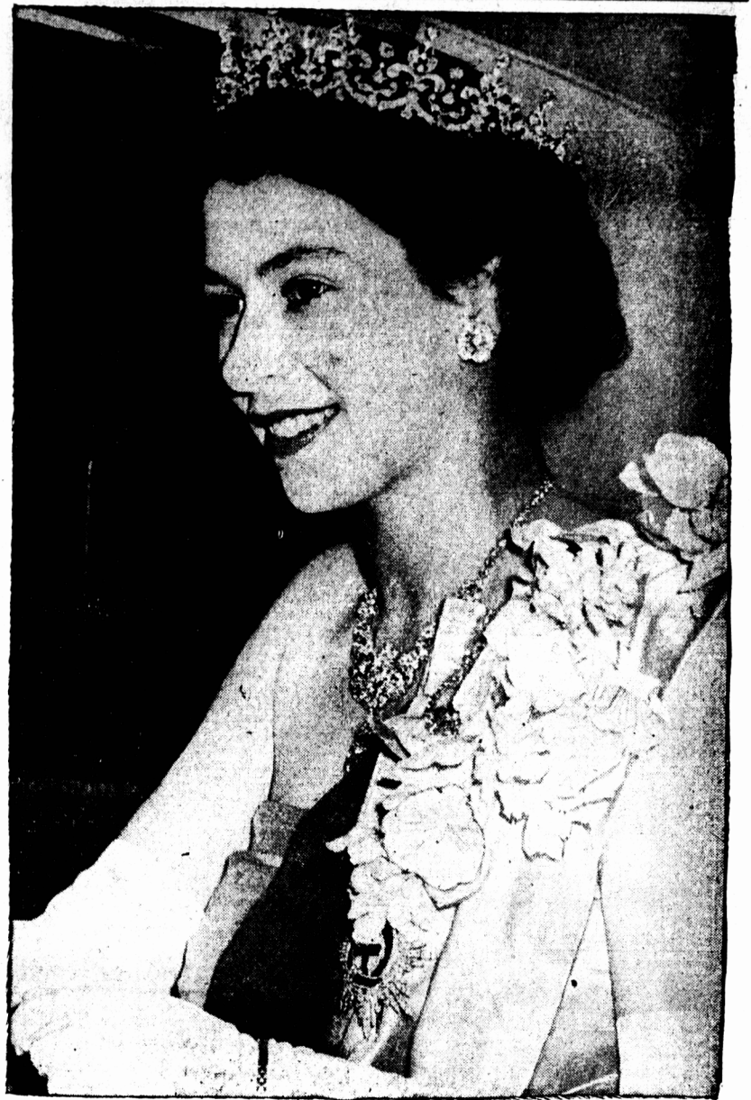
The first reigning Queen since Victoria. Princess Elizabeth becomes Queen Elizabeth II, Monarch of Britain, the Commonwealth and the Empire.