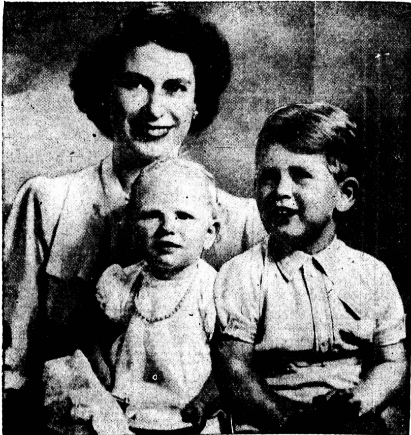
Trained from childhood to assume arduous role of Sovereign, Queen Elizabeth is seen in her favorite role as mother.