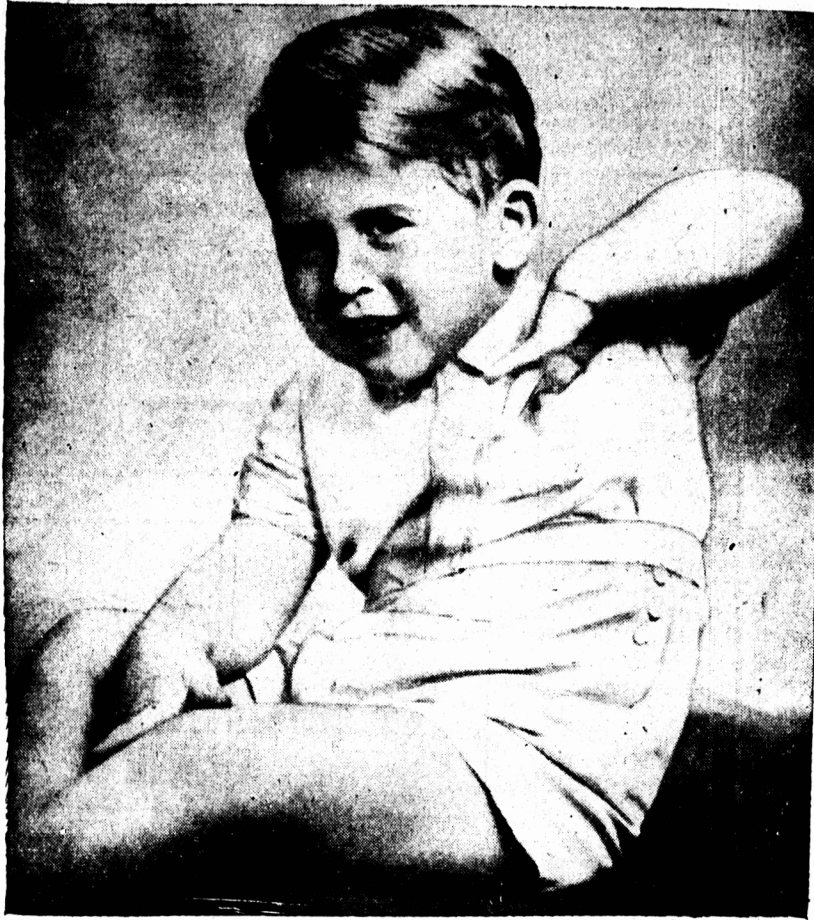
Three-year-old Prince Charles, heir to the Throne.