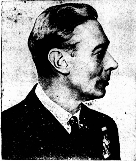
Britain and the Commonwealth mourn their beloved King whose devotion to duty shortened his life.