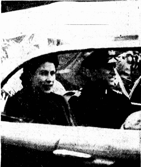
Queen Elizabeth II and her Prince Consort pictured in royal car during recent visit to Prince Edward Island.