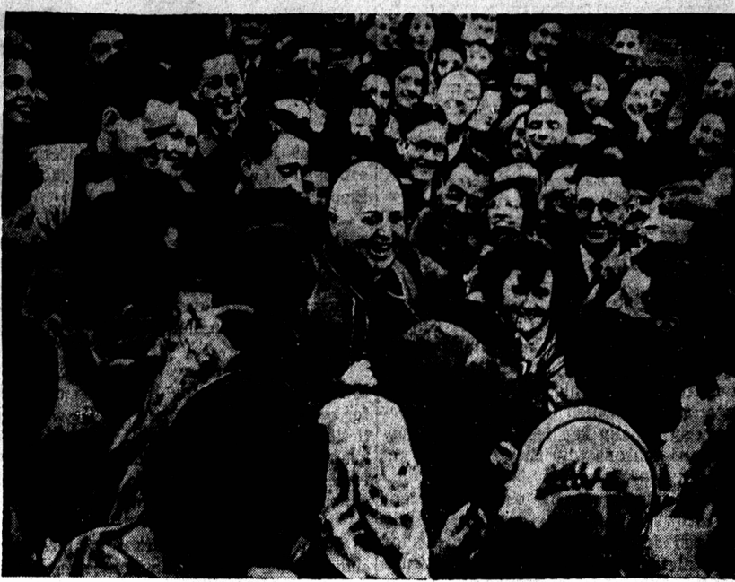
Despite the almost continuous rain, thousands of persons were on hand for the garden party held in conjunction with the Catholic hierarchy congress now being held in London, Eng. St. Mary's College the congress.