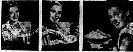
Mashed potato! Shepherd's pie topping! Potato soup!

In a matter of minutes, with practically no work, you can now serve appetizing potato dishes. Just get the remarkable new food product called French's Instant Potato—now at your grocer's. Then do this: WASH till dinner is ready. Then bring some salted water to a brisk boil, add milk and French's Instant Potato as directed on package. Stir until potato has thickened as desired; add butter and whip until light and fluffy. That's all—½ cup makes 4 to 5 servings of delicious mashed potato at only a few cents a serving. SHEPHERD'S PIE TOPPING. Mashed potato as prepared above makes a grand topping for Shepherd's Pie, meat pies, and baked dishes. POTATO SOUP. To 3 cups very hot (not boiling) milk, stir in gradually ¼ cup French's Instant Potato. Stir over low heat until mixture thickens. Season with onion salt, pepper and butter. Serves 3. Try this magic new product soon. You will find French's Instant Potato in the canned vegetable section at your grocer's.