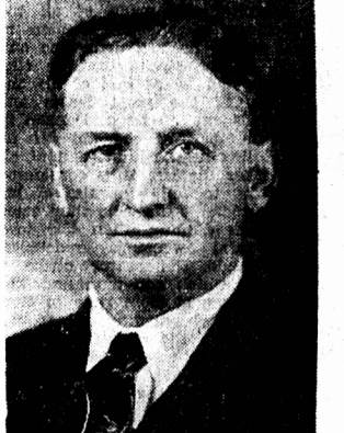
Hon. Forrest W. Phillips, Speaker during the last General Assembly, who was re-installed prior to the opening of the special session of the Legislature yesterday.