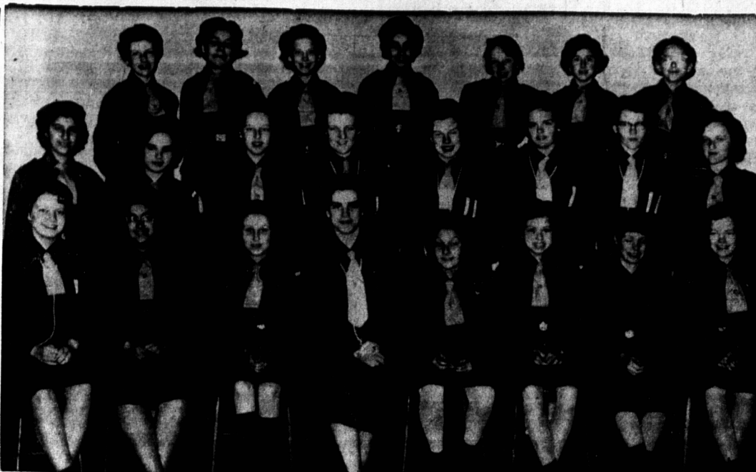
FIRST BANNER GUIDE CO. IN P. E. I.