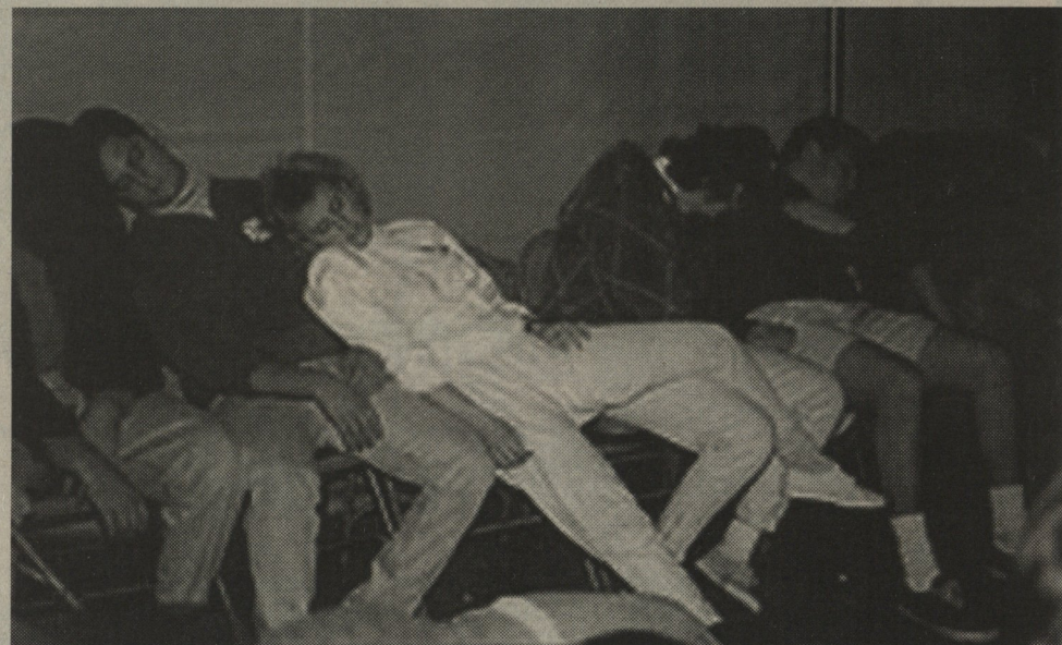
Practicing for Drink The Barn Dry

As exams draw closer and closer, I realize that it's almost the end of the first semester. September feels like it was only yesterday, yet it also feels like a million years ago. It's already November, and if we are to believe what the media and the decorations that are cropping up everywhere say, then Christmas is just around the corner. Time sure flies by when you're having fun - or at least when you're too busy to notice it sailing past. They say that as you get older, the years go by faster and faster.