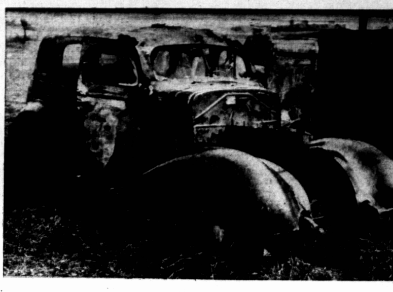
BURNED BEES TOO