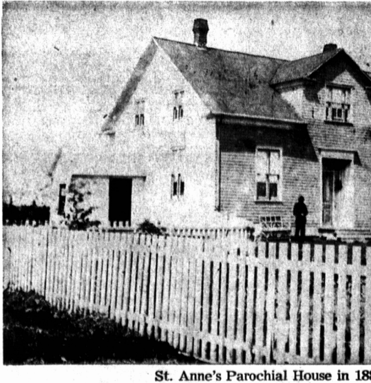
St. Anne's Parochial House in 1885