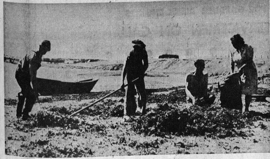
FARMERS GATHER IRISH MOSS FROM SHORE

A cash crop on Prince Edward Island which requires no capital outlay and one which the whole family can help harvest is "Irish Moss". This sea plant which grows in clusters up to nine inches in diameter is washed in to shape by the storms of